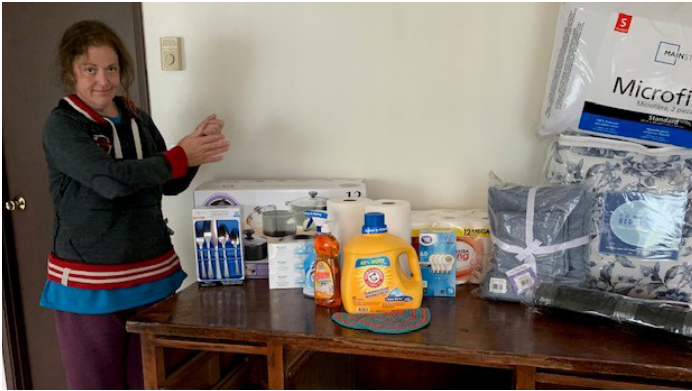
A YCAP client and recent graduate of our Rent Well program receives a "Street to Home" supply kit and keys to her very own apartment.

This past year, the YCAP Client Services and Housing Department was excited to add an innovative new program to our continuum of existing housing and homelessness services. The project is a supportive housing program for persons who are medically fragile and experiencing homelessness. In response to a rising trend of individuals with serious medical issues being encountered by the YCAP Client Services and Housing team, this housing