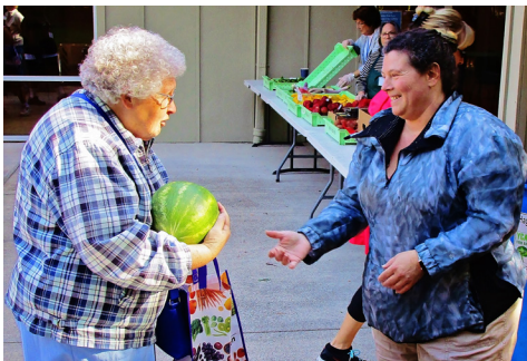
Volunteers distribute fresh, high quality produce at the McMinnville Senior Center

As the summer growing season comes to an end, our clients have let us know how very grateful they are for YCAP’s fresh produce program, Harvest2Home (H2H). Every single week the program has successfully distributed thousands of pounds of fresh fruit and vegetables to neighborhood distribution sites and meal centers throughout Yamhill County, including our largest site at the McMinnville Senior Center.