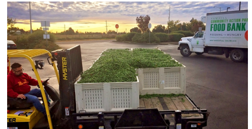
Freshly picked green beans, donated by Ruddenklau Farms for YCAP distribution

need of shelf-stable items to fill the cupboards during the cold winter months ahead. Our shelves are currently empty of many essential products, including hearty soups and chili, peanut butter, canned tuna and meats, beans, pasta and canned