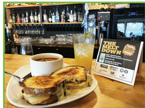
They really melted the competition!