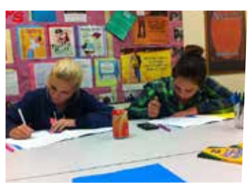
Teens working their job readiness skills at Youth Outreach

Youth Outreach in Newberg participated in the Point in Time Homeless Count serving as one of the drop-in sites and operating three street outreach teams. Twelve homeless youth were provided with food, bus tickets, survival aids such as tarps & blankets, or winter weather gear; while outreach teams